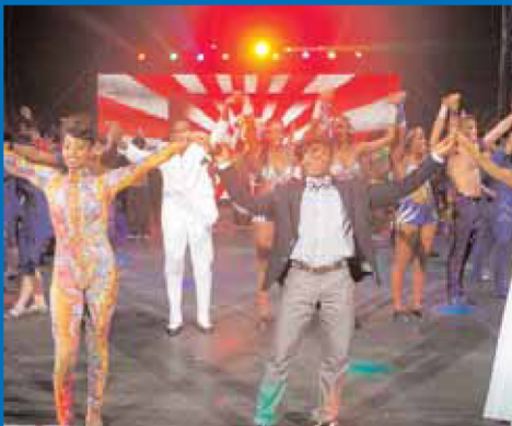
UniverSoul Circus Performances in the Bronx, Brooklyn, Queens and Newark page 2

The Harlem News Group, Inc. Connecting Harlem, Queens, Brooklyn and The South Bronx