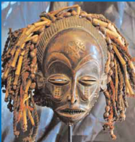
Connoisseurs of African Art Emerging in Harlem page 14